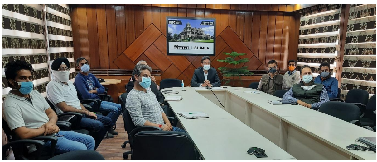
NIC HP State Centre Officers at Shimla

The eKalyan mobile app, developed by NIC District Centre, Solan has got the Certificate of Appreciation. The App enables welfare pensioners of Old age, Widows, Differently Abled to view their quarterly pension details in systematic manner in the App. Besides, the Departmental officials can monitor the status of timely disbursement of pension in all districts of the State. It has back-end integration with the eKalyan software implemented in the State of Himachal Pradesh.